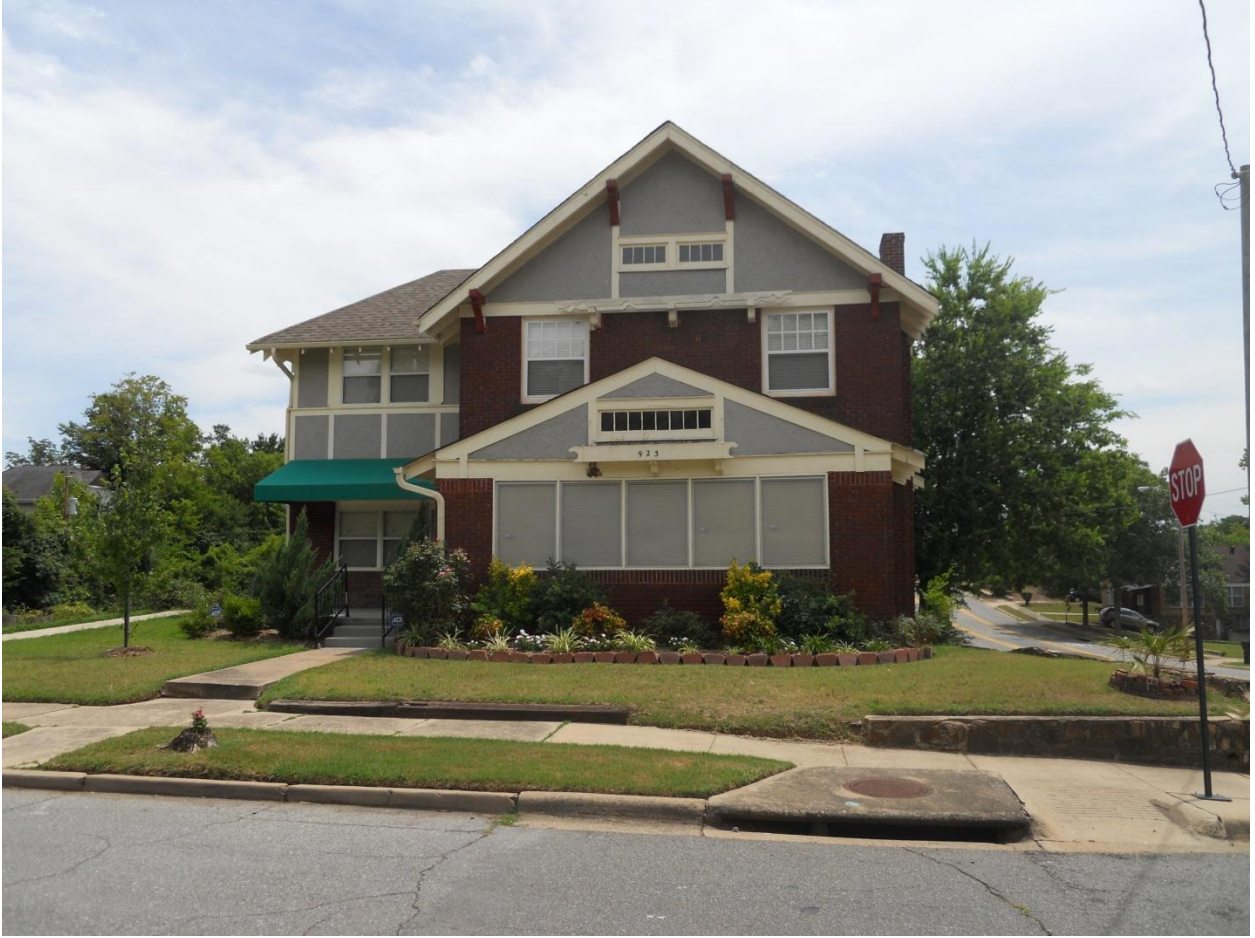
Jenkins House, July 2013