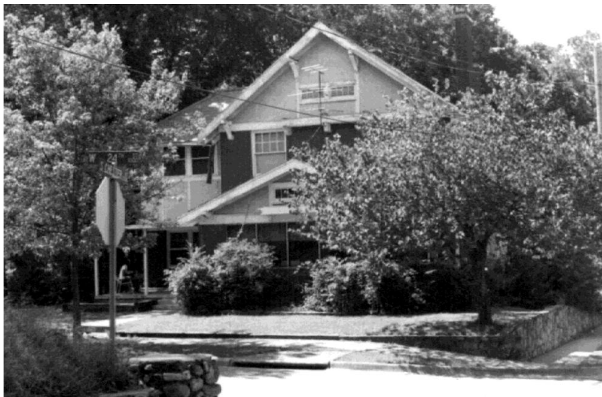
Jenkins House, 1987