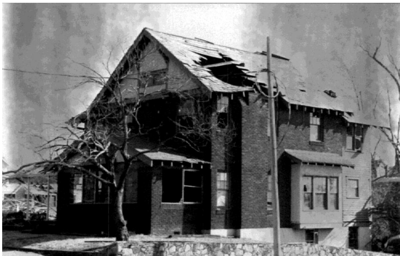
Jenkins House after 1999 tornado